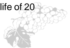
Table 12 represents production expenses and cash sales for maintenance years, 11 through 20. Once the vineyard is established and operating at full production, expenses and sales are assumed to be constant. A well managed vineyard can be productive for 20 years and 30 to 40 years are not unusual. In this analysis, we assume a vineyard life of 20 years.

Tables 3 through 11 show production expenses and cash inflows for the transition period (years 2 through 10) from establishment to maintenance. Total accumulated net returns, annual revenues minus expenses, show how much is available to pay off establishment costs (land, equipment, etc.), including interest. Total accumulated expenses peak in year 3 and in year 10 the vineyard begins generating a positive accumulated cash flow.